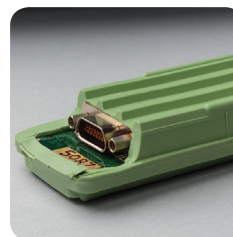
Molded modules are durable and serviceable