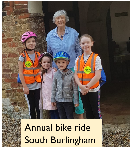
Annual bike ride South Burlingham