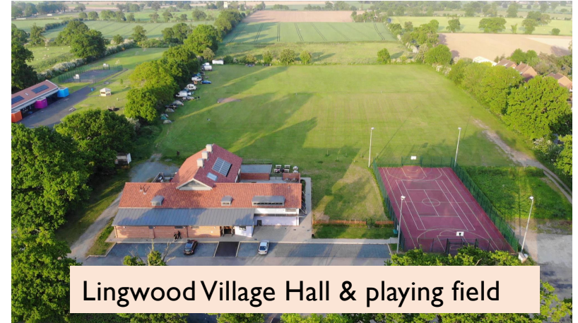
Lingwood Village Hall & playing field