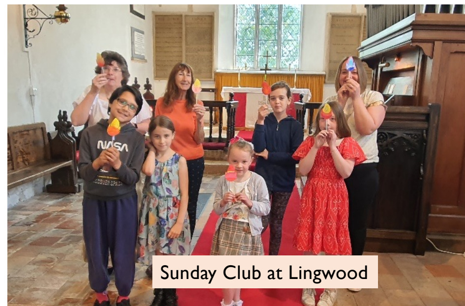
Sunday Club at Lingwood

There were 32 adults and 5 children for the carol service.