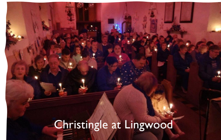
Christingle at Lingwood