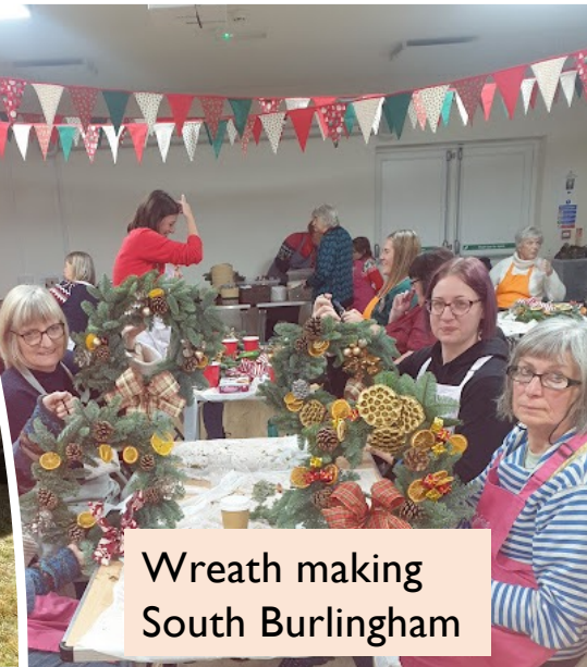
Wreath making South Burlingham