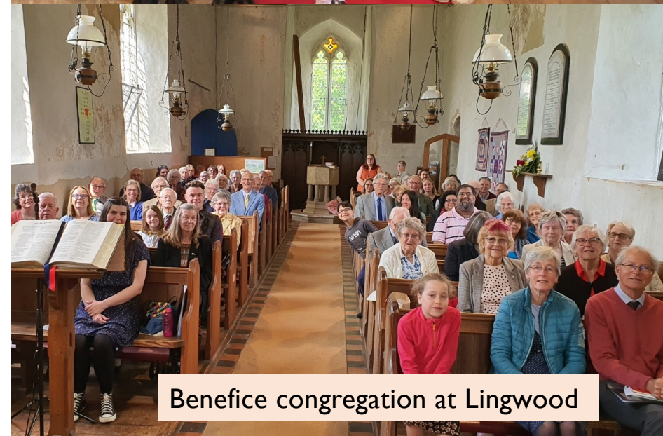
Benefice congregation at Lingwood