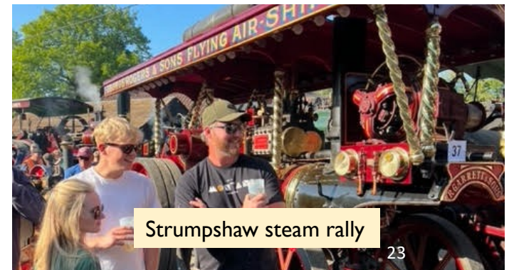
Strumpshaw steam rally