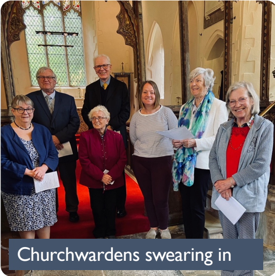
Churchwardens swearing in