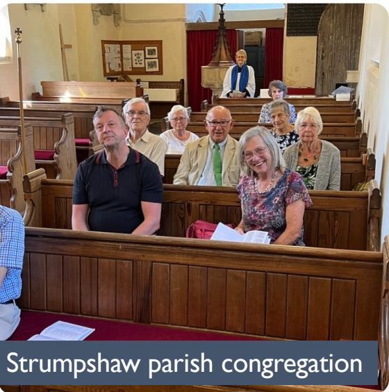
Strumpshaw parish congregation