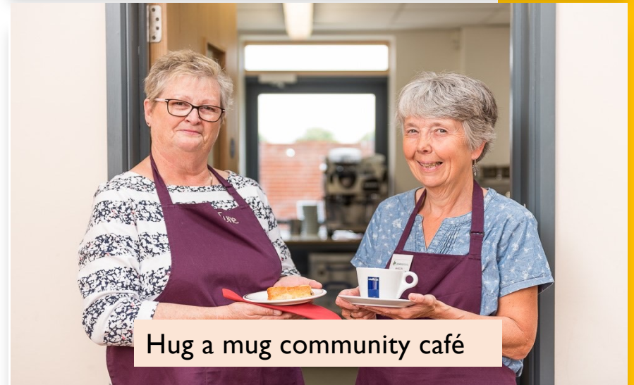
Hug a mug community café