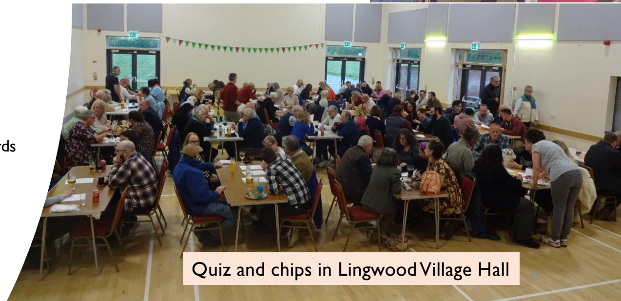
Quiz and chips in Lingwood Village Hall