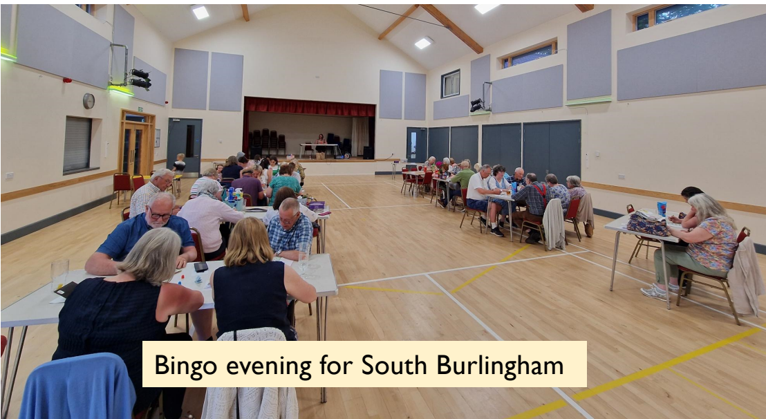
Bingo evening for South Burlingham