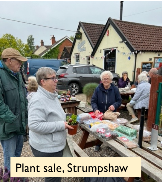
Plant sale, Strumpshaw