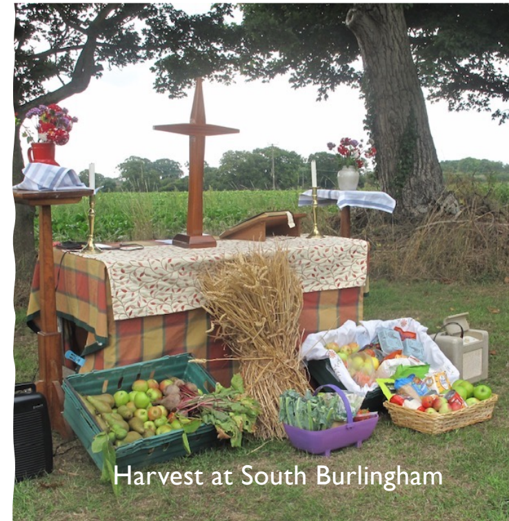
Harvest at South Burlingham

Exploratory conversations are taking place in Strumpshaw about the possible introduction of a lay led 'garden church' which would meet in a parishioner's home.