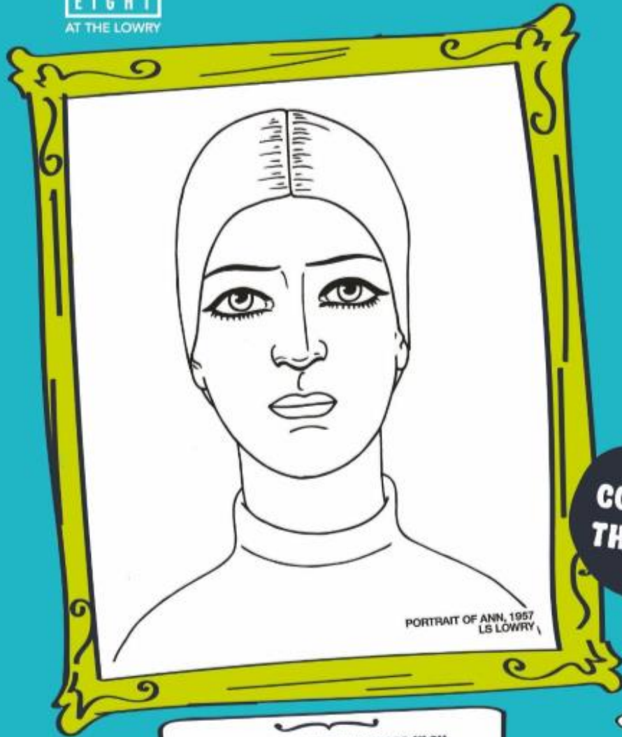
PORTRAIT OF ANN, 1957 LS LOWRY