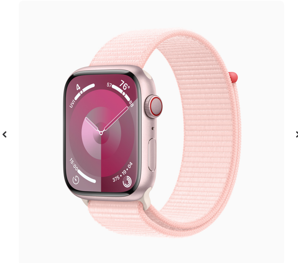
Any aluminum Apple Watch Series 9 or SE when paired with the new Sport Loop is carbon neutral. (Pictured: The pink aluminum Apple Watch Series 9 with the pink Sport Loop.)