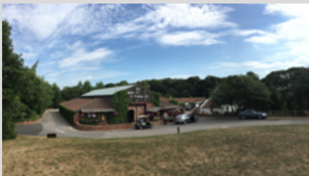
Mixed Use Leisure Opportunity North Yorkshire YRK1661 £1,600,000