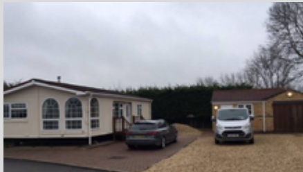
Mobile Home Park Lincolnshire YRK1833 £650,000