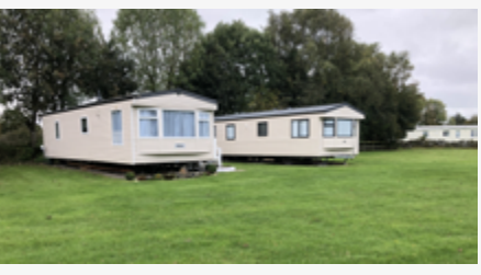
Mixed Holiday Park Llyn Peninsula YRK1815 £1,800,000