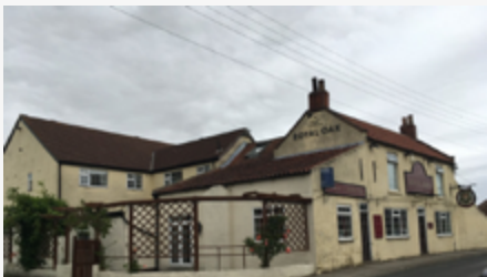
Public House & Caravan Park Development Opportunity North Yorkshire YRK1793 £645,000