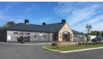
Touring & Camping Park South Devon DVN1821 £1,295,000