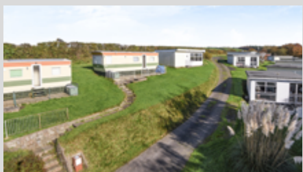
Holiday Park Devon DVN1812 £650,000