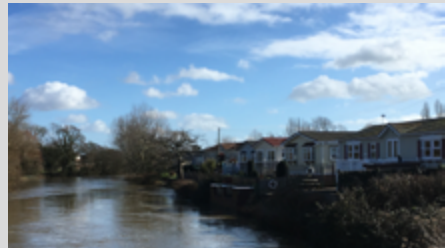
Residential Park Home Estate Dorset DVN1774 £3,100,000

Please contact us if you would like any further information or would like to register on our mailing list.