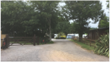
Long Established Mixed Park Somerset DVN1823 £1,950,000