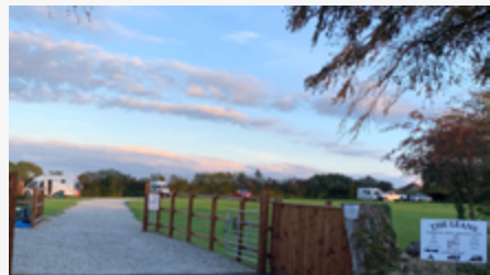
Certified Location Site Cornwall DVN1836 £595,000