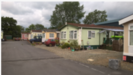
Residential Park West Wales DVN1753 £650,000