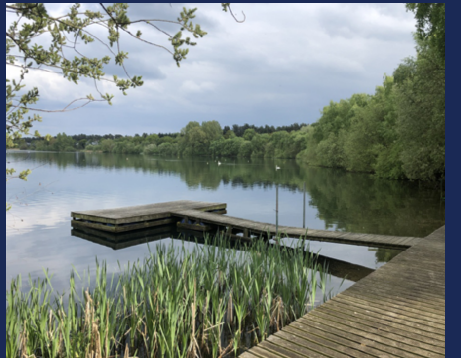
Mobile Home & Lodge Development Lincolnshire YRK1817 £2,750,000