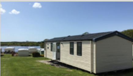
Static Holiday Park Cumbria YRK1828 £1,625,000