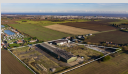
Lodge Development Opportunity Skegness & Ingoldmells YRK1837 Offers Invited