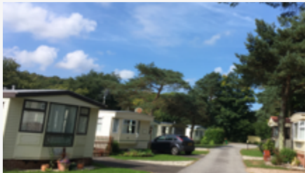
Holiday Park, Cottages & Adjoining Residential Park Cornwall DVN1804 £4,000,000