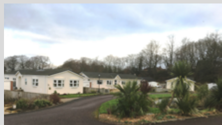
Residential Park Devon DVN1809 £2,500,000