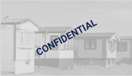
Holiday Park & Wedding Venue Cornwall DVN1822 £3,000,000