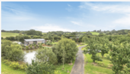
Residential Lodge Development West Devon DVN1834 £1,650,000