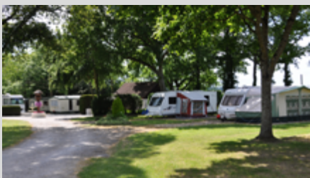
Mixed Holiday Park Somerset DVN1826 £1,600,000