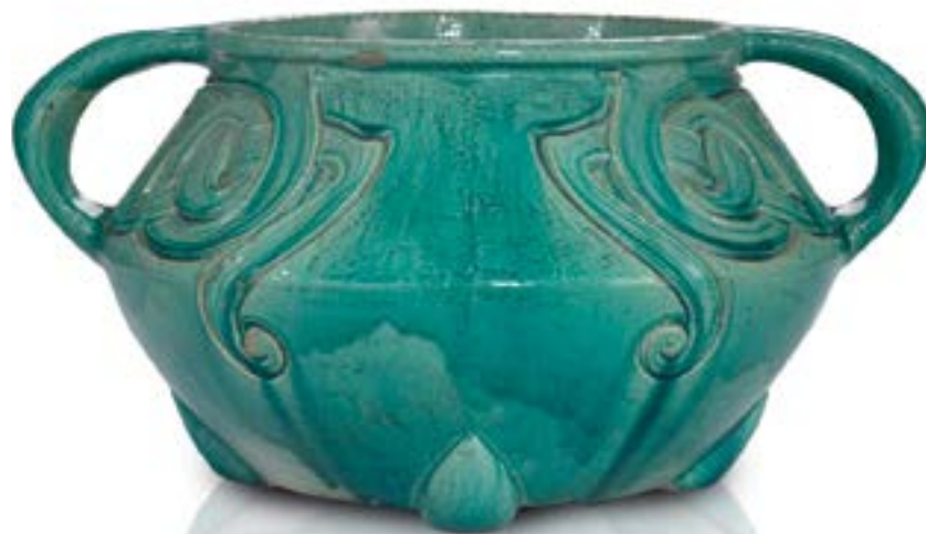
CLOCKWISE FROM TOP An ornamental turquoise earthenware jardinière designed by Knox for Liberty c1900-1905; he designed this 'Bollelin' charger in pewter with a blue-green enamel decoration for the Liberty 'Tudric' range c1902-1905; an interesting silver and enamel brooch designed by Knox for Liberty c1902