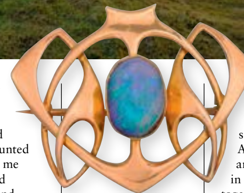
ABOVE, TOP A panorama of the southern end of the Isle of Man, which greatly influenced Knox, with a Celtic Cross in the foreground ABOVE, BOTTOM A gold brooch with a single opal, designed by Knox for Liberty c1900-1904