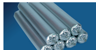
600ml foil packs Part No: AC600WTCE