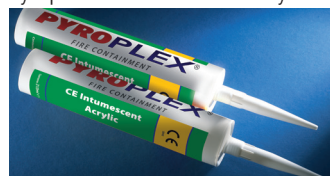
310ml cartridges Part No: AC310WTCE

Pyroplex ® CE Intumescent Acrylic is supplied in: