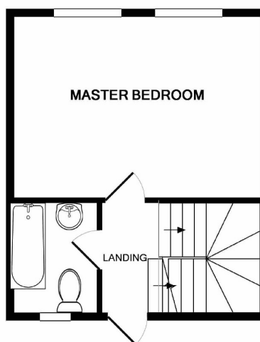
1ST FLOOR APPROX. FLOOR AREA 287 SQ.FT. (26.6 SQ.M.)

TOTAL APPROX. FLOOR AREA 823 SQ.FT. (76.5 SQ.M.)