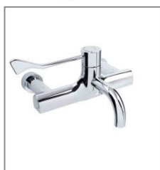
Lever operated tap TPMEDREM