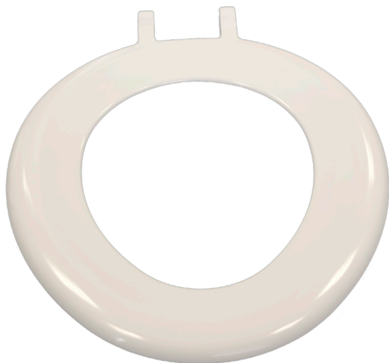
Shown: Ring seat STWHRING