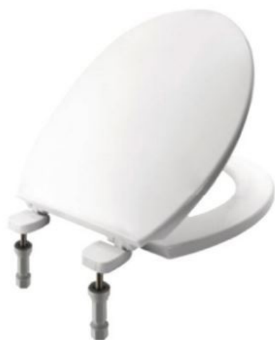
Shown: Sta-Tite seat STWHOAK