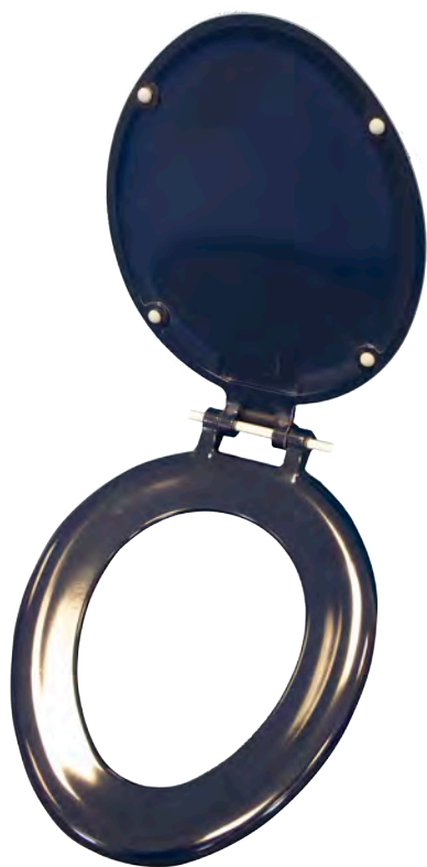
Shown: Ring seat STDBLRING