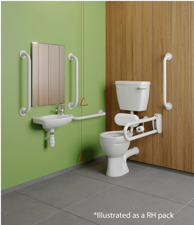
*Illustrated as a RH pack