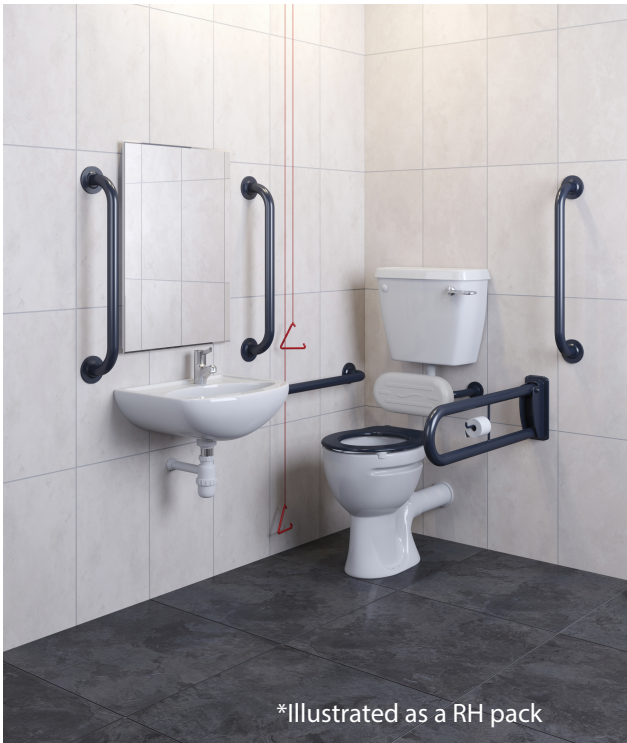
*Illustrated as a RH pack