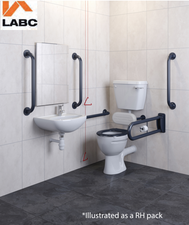
*Illustrated as a RH pack