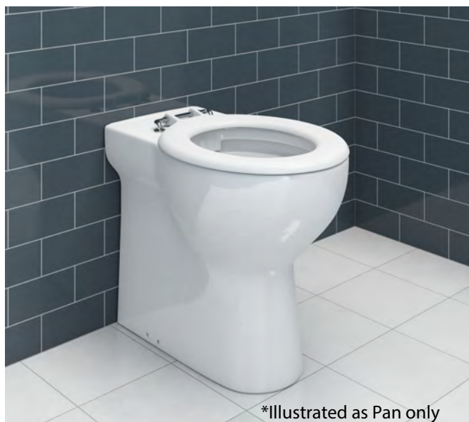
*Illustrated as Pan only