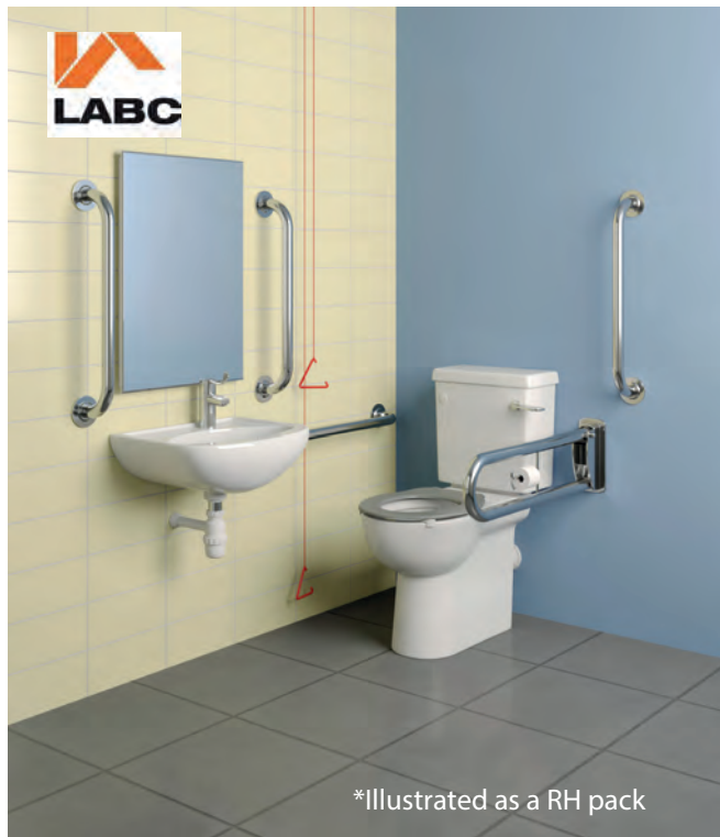
*Illustrated as a RH pack