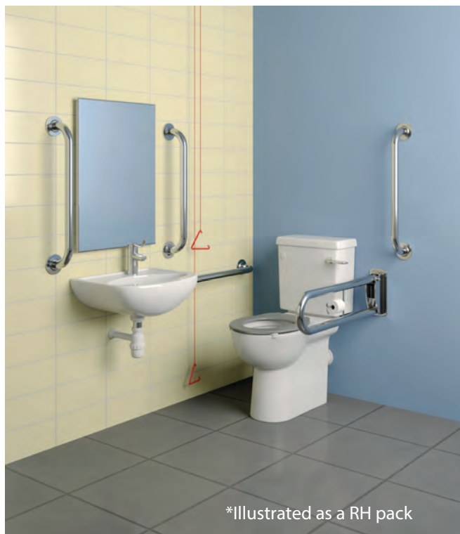
*Illustrated as a RH pack