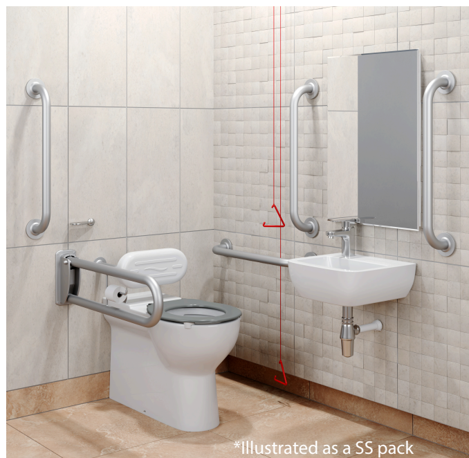
*Illustrated as a SS pack