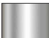
Polished s/s LRV - 58