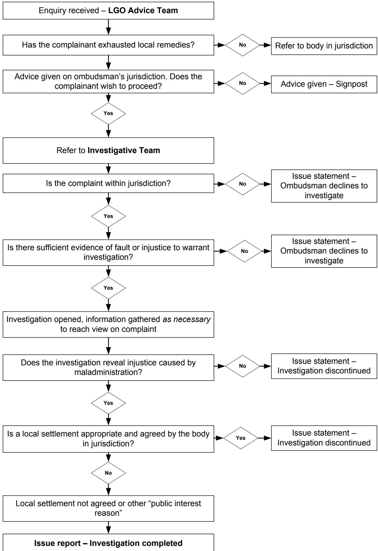
Chart 1: Local government Ombudsman