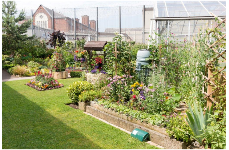
PICT 1 – GARDENS IN FRONT OF G BLOCK

The prison includes seven residential wings with most cells accommodating two residents and currently has on site 15 Bunkabins, which were required to reduce cell sharing, enable better social-distancing and support shielding measures. Each wing has in-cell sanitation and a shower block. Except for four cells in B wing, in-cell showers are only available in the newest wing (G) and Bunkabins. One wing (D) was used for induction, to accommodate the healthcare centre, to support reverse cohorting during the pandemic and also the support and separation unit (SSU). For the majority of the period of this report the SSU has not been used for its intended purpose, but instead as a protective isolation unit (PIU) for those residents confirmed as being Covid-19 positive.