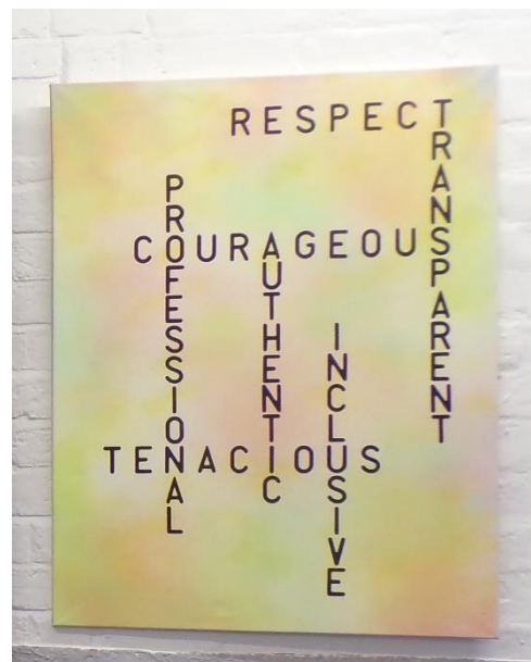
PICT 4 – UNITY 7 VALUES

During the restricted regime, the Board was pleased to see the establishment use the time to focus on creating a community hub called Unity 7 (the name reflecting the prison commUNITY and its 7 values, see PICT 4). This hub will provide a coffee-shop-type environment for residents to visit and contains the charity clothes shop, which has been a very successful and welcome provision for residents over several years. The hub was a joint effort between residents/staff and AMEY. The quality of the finish and the overall ambience of the area was superb. It provided yet another opportunity for resident artwork to be displayed and residents to prepare for life outside of prison.