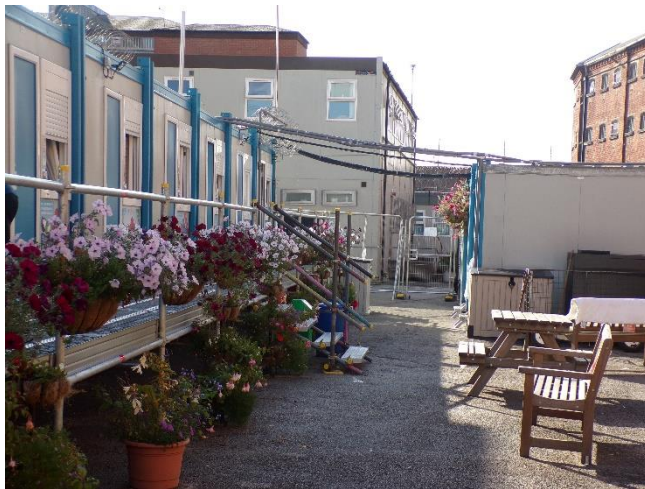
PICT 3 - BUNKABINS

As a result of the closure of one wing to be recreated as the SCU (regional care facility), and the need to create extra space for shielding, 15 Bunkabins arrived on site for some of the displaced residents (see PICT 3). The feedback on these was highly positive, especially the lack of window and door locks, which gave residents a feeling of trust.