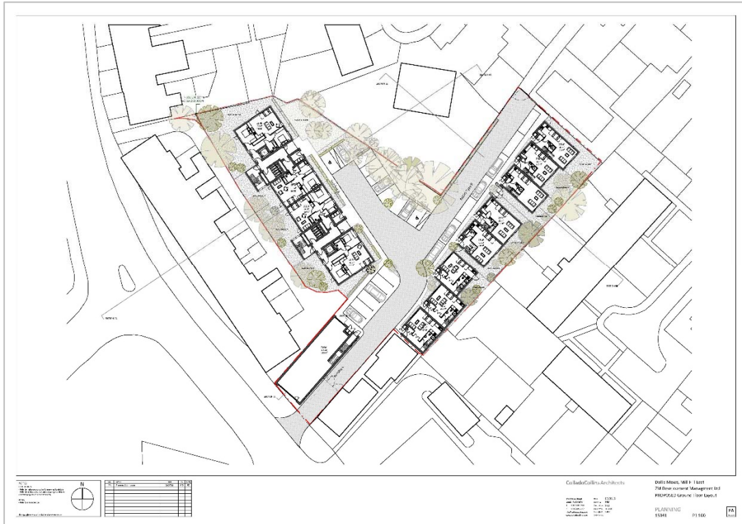
Fig 1.1: Proposed Site Plan prepared by Collado Collins Architects

In accordance with the Development Management Policies of Barnet's Local Plan (September 2012) and the London Plan this Sustainability Statement has been set out to show how the site addresses the relevant environmental and sustainability issues outlined in Barnet's Local Plan SPD: Sustainable Design and Construction (April 2013).