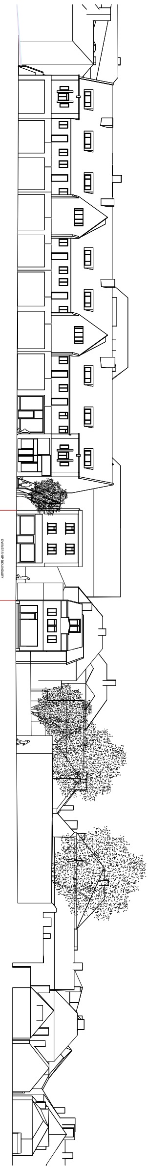
E3 Dolis Road Elevation E3-003 SCALE 1:500 @ A3

NOTES CONSULTANTS Refer to highways consultant's drawings for details Refer to landscape consultant's drawings for details Landscaping types is indicative only A/E/S Refer to area schedule © Copyright Reserved ColladoCollins Partners LLP