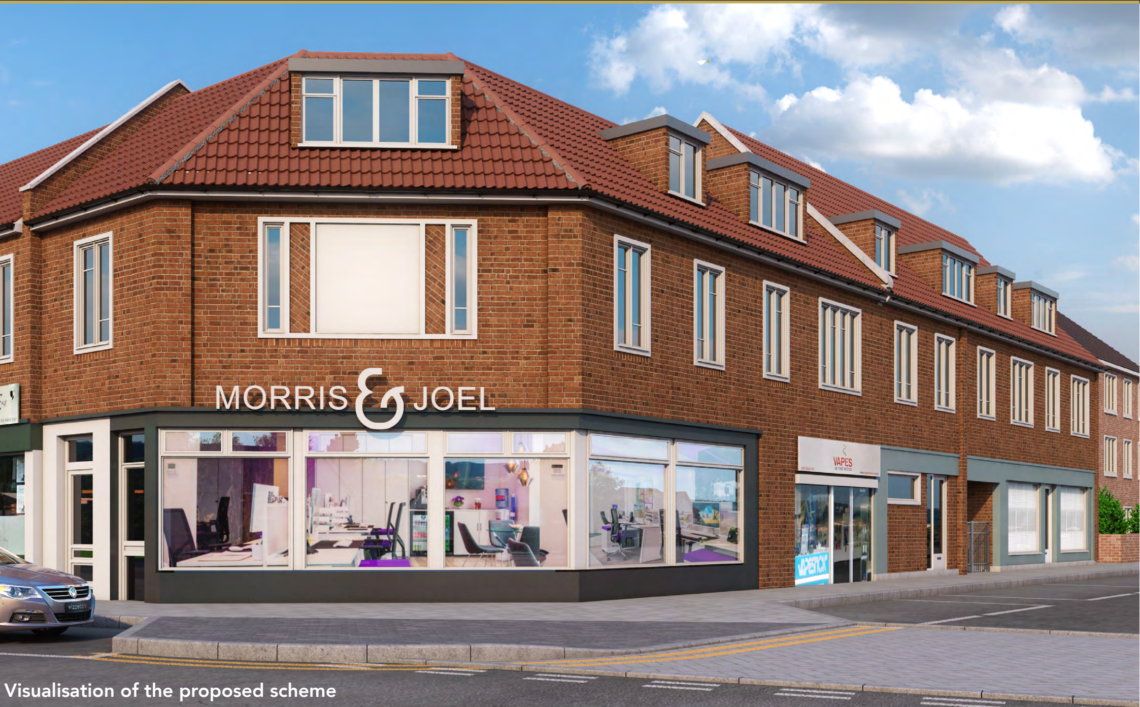
Visualisation of the proposed scheme