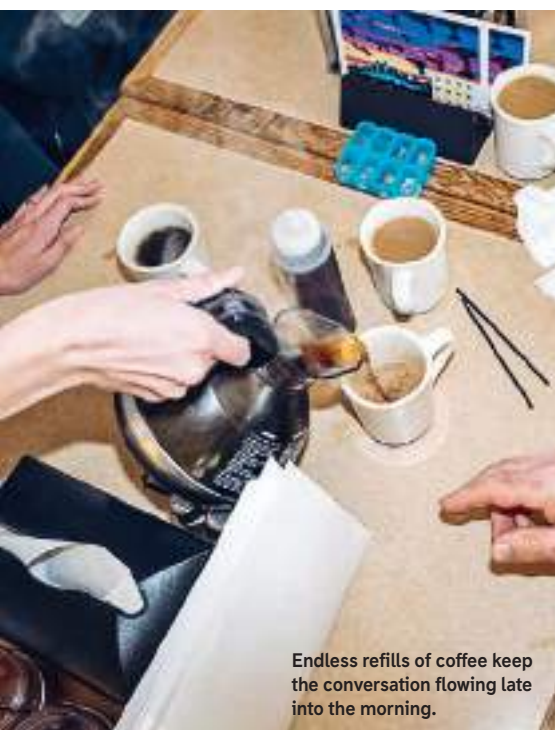
Endless refills of coffee keep the conversation flowing late into the morning.