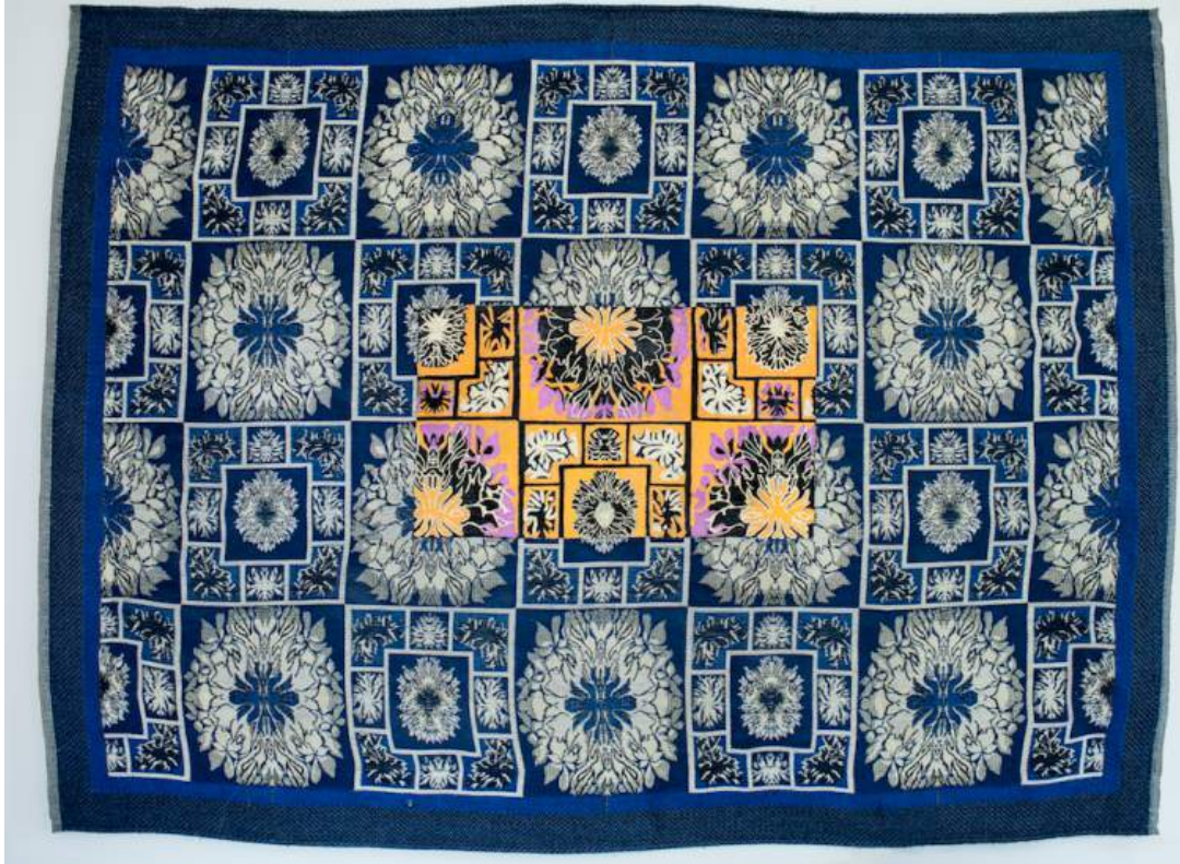
Image courtesy of Gazelli Art House, artwork copyright Farhad Farzaliyev

The exhibition opens with the plexiglass work of Orkhan Huseynov, mixing rockets with traditional Islamic architecture, the black, white and gold images bring past and future together. In The Launch (2018) for instance, an ornate tower flies into the sky under a mass of gold smoke. The works ask the viewer to consider what happens once the tendency to place origin as a defining factor is shattered, presenting tradition in an uncharted and unfamiliar context. Flying towards space, the shuttle is heading on a journey to a place where national identity is seemingly unheard of, causing the viewer to consider how cultural and religious identity is preserved once living elsewhere.