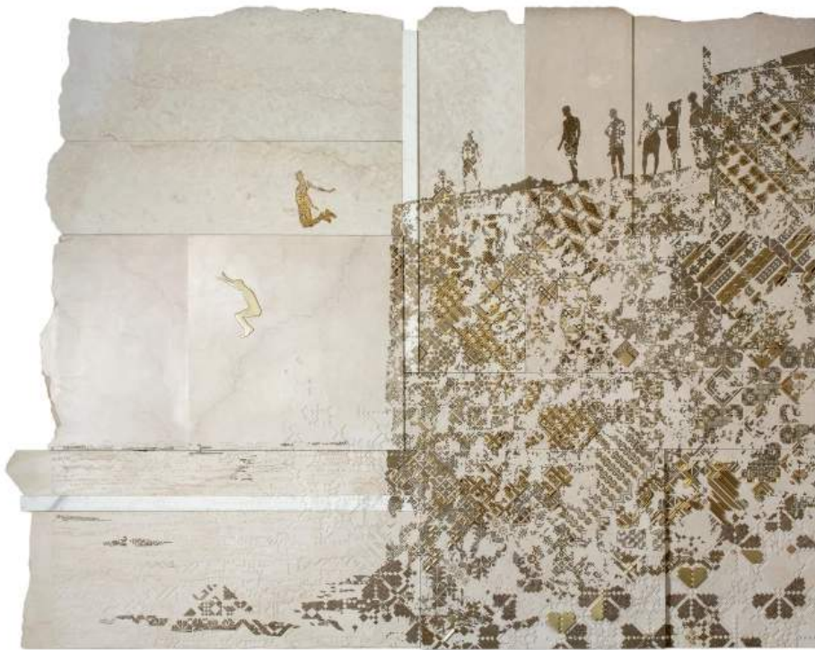
artwork copyright Naqsh Collective

In Akka Artwork (Naqsh Collective, 2019), a large-scale piece made of natural stone marble and brass, a number of figures line up to jump off of a tall cliff into a calm sea down below. As they leap from their highly intricate surface, they wave their hands in the air and look down below expectantly, as if beginning a journey to a better, cooler world that the calm water will secure for them. The artwork, by Amman-based sisters Nisreen and Nermeen Abudail, is influenced by the tradition of Palestinian embroidery, the patterns of which make up the rock that their characters are leaping from. The work is part of a larger group exhibition titled bahith at London's Gazelli Art House.