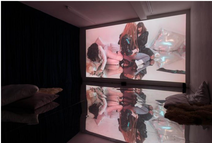
Zoe Williams, Sunday Fantasy , 2019 (installation view, Mimosa House, London).

feeling subjects unable to escape unresponsive or mechanical bodies. Mixing and matching styles – Bacon seems to have influenced the rendering of certain faces while Cubism is apparent in the reduction of complex physiognomies to regular shapes – Hewitt's paintings catch something of the millennial generation's much-vaunted sense of melancholy, displacement and alienation.