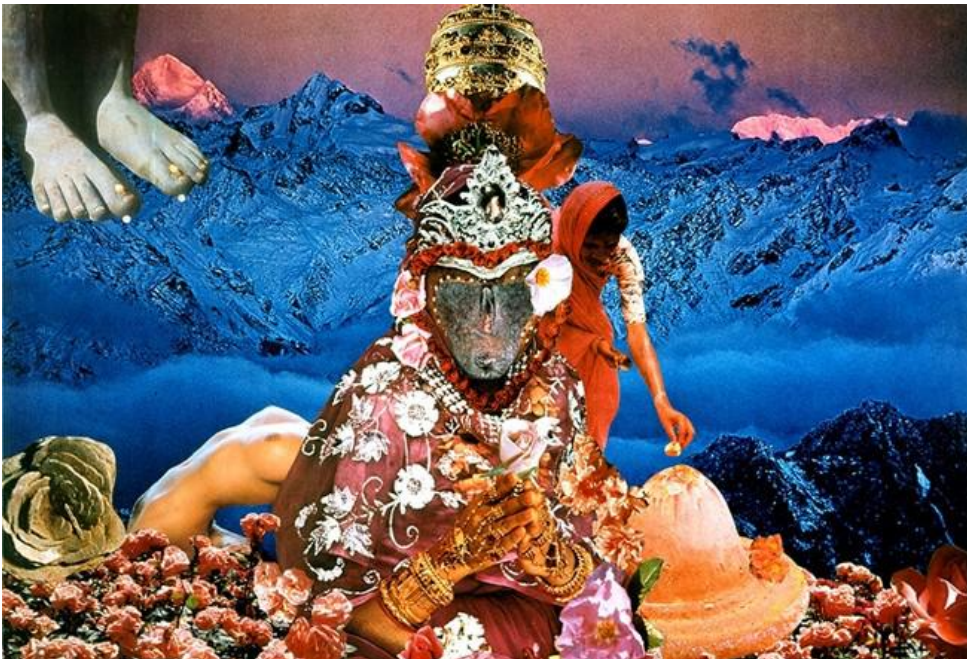
Penny Slinger, Offerings at Twilight , 1976, photo-collage on board, 42 x 59 cm.

The first of ArtReview's four themed guides on what to see during Mayfair Art Weekend