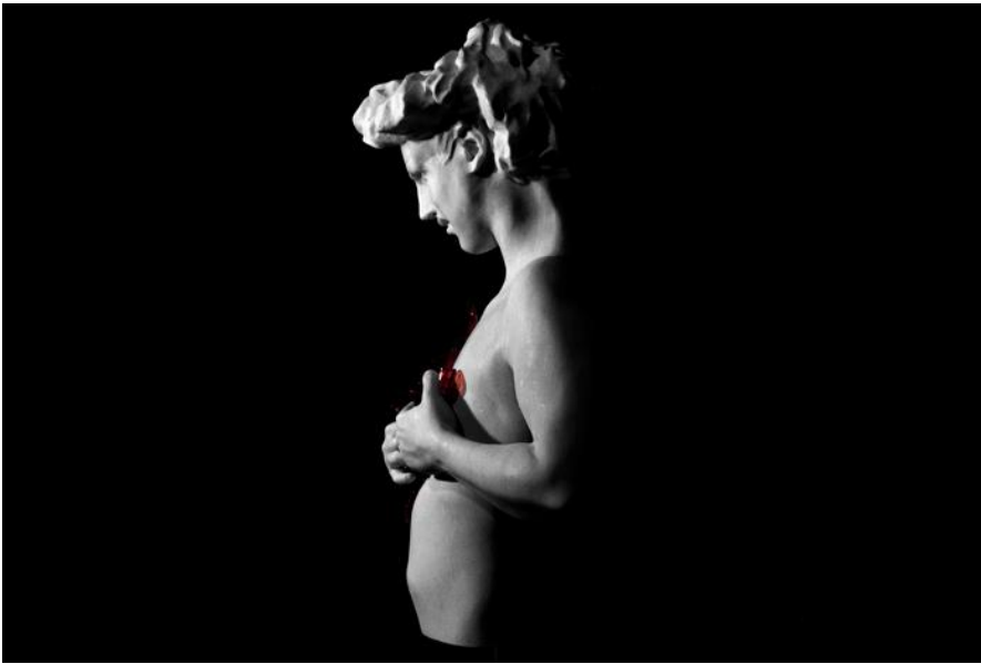
Michelangelo Galliani, Amore, 2019, Carrara marble, glass and stainless steel, 100 x 76 x 38 cm.