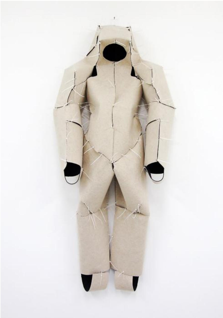
Didier Fiúza Faustino, Home suit Home , 2013, carpet and nylon cable ties, 90 x 35 x 190 cm. Courtesy the artist and Galerie Michel Rein, Paris & Brussels