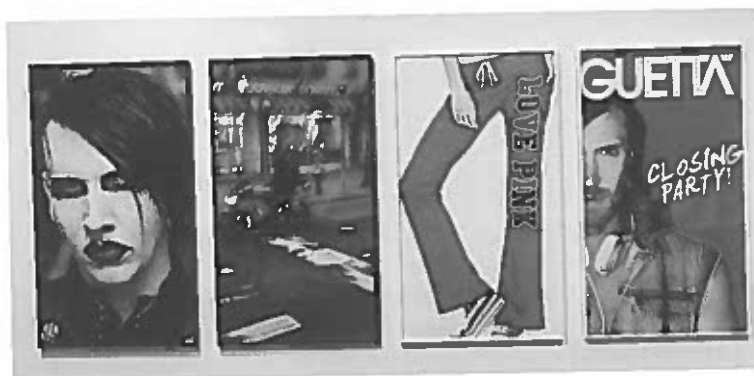
Cory Arcangel 'BACK OFF' installation view

work, the abstract shapes roughly corresponding to forms in the found images. New York and King George V Avenue Cardiff reinforce Guy Brett's notion that Boshier's preoccupations are closer to those of the Independent Group (from which Pop Art sprang) than to those of Pop Art itself. Boshier's is a magnificently complete integration of art with life – the exhibition includes shelves of Boshier's VHS collection, their spines all drawn and decorated with leitmotifs from each film, and examples of his painted and collaged envelopes posted to correspondents across the globe. These once-dispatched envelopes take on curious boomerang-like properties when collected back together like this. Similarly, the near-obsolence of the VHS format becomes a poetic postscript to Boshier's already poetic exercise in the personalisation of movies which mostly come from the studio system. Pairing artists' work like this risks encouraging a frivolous search for similarities and differences between their practices, but at Mostyn there is a real conversation between the exhibitions. In the end (to adopt the eschatology both artists suggest), each artist's work illuminates the other's in fascinating and unexpected ways. ■