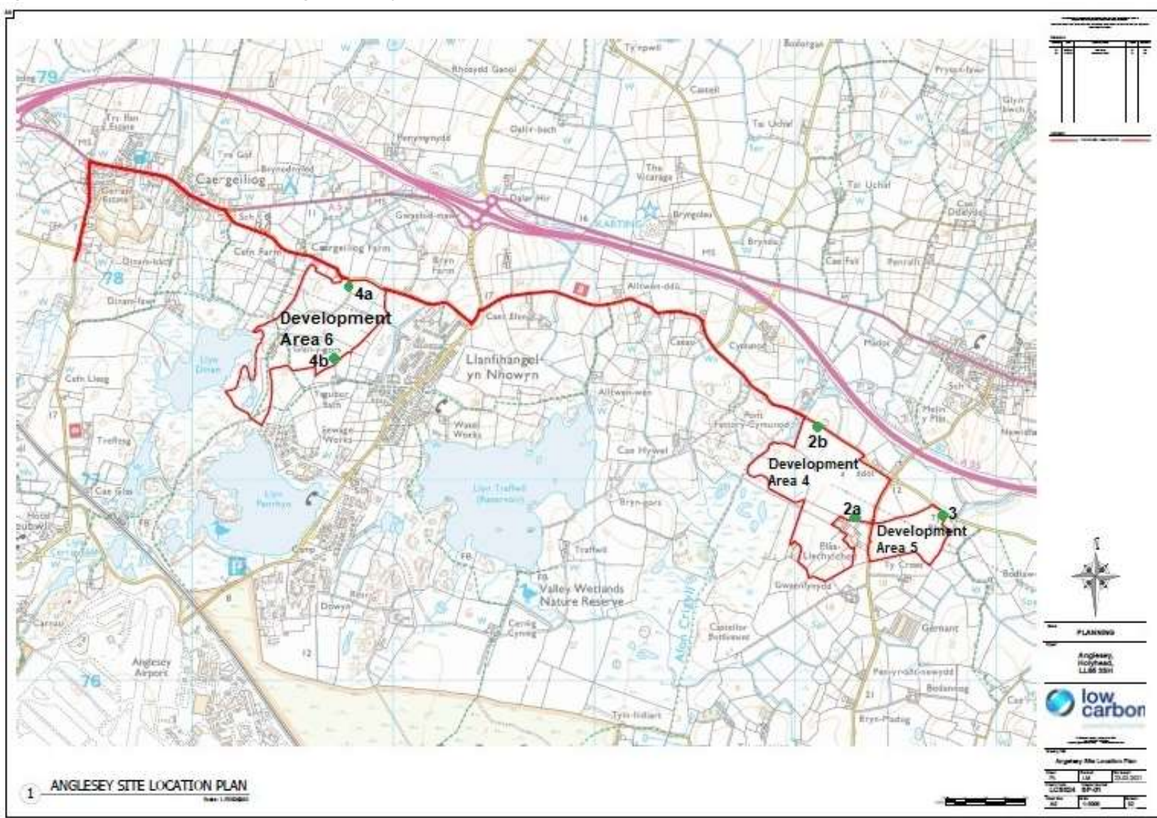
Figure 8-1: Baseline Sound Monitoring & Development Areas