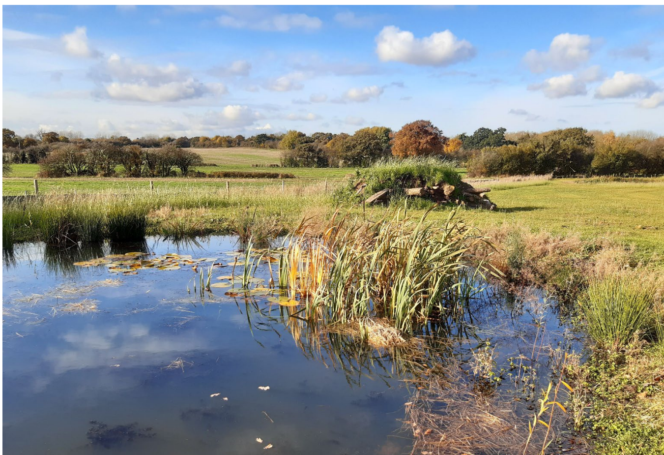
Pond and hibernaculum constructed at Coleshill Manor ecological mitigation site

Please be assured that we will continue to work within the necessary regulations, including licences from Natural England. In accordance with the law, qualified ecologists will be on site to ensure wildlife species are protected, including checking and monitoring the area for nesting birds, and taking action to safeguard them from any of our works.