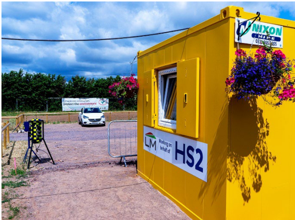
HS2 compound in Warwickshire

Water, power and other utility services will be diverted to the main compound locations to support the workforce once construction begins.