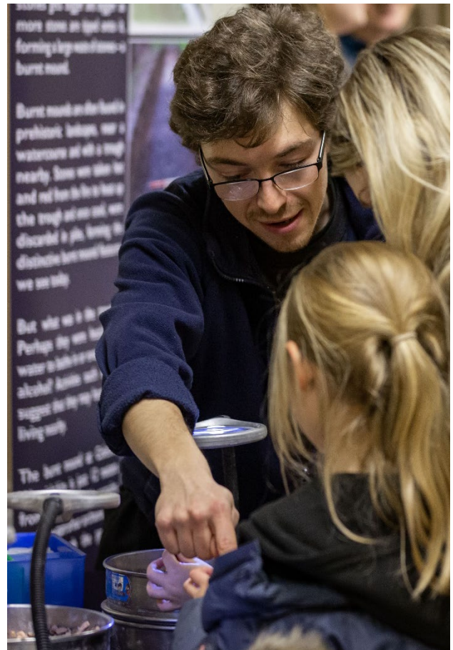
Photo from our 'Meet the Expert' event in Coleshill

We are also continuing our archaeological investigation work at various points across the route. We will share further information about these works and any finds throughout construction.