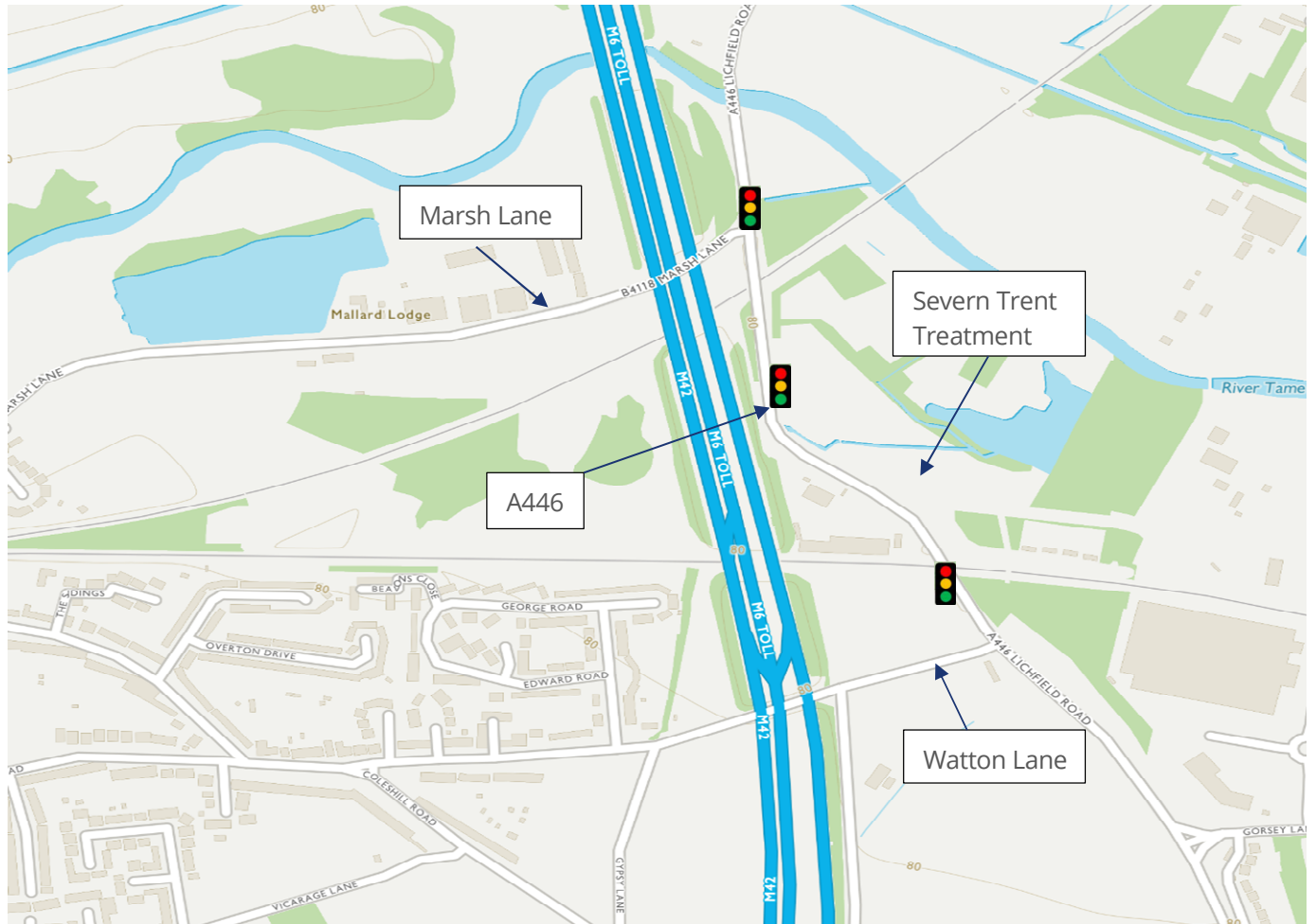
Contains Ordnance Survey ©Crown copyright and database right 2017