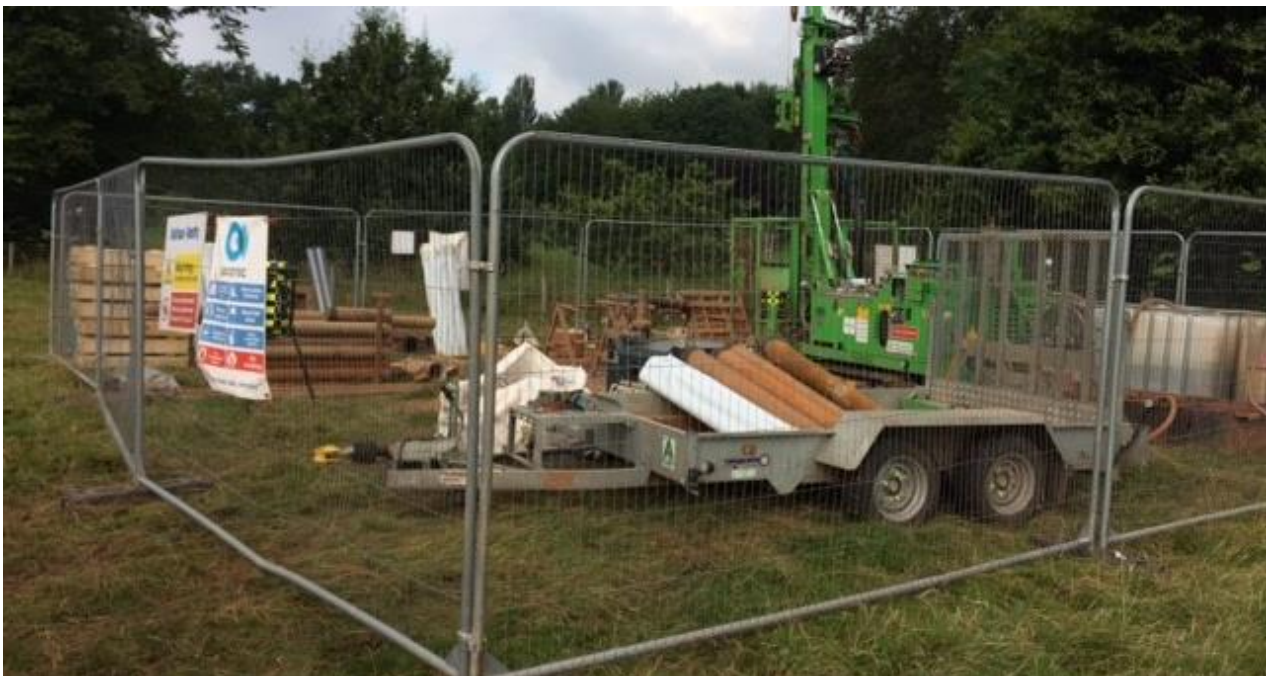
Example of trial boring that make up part of the ground investigation work