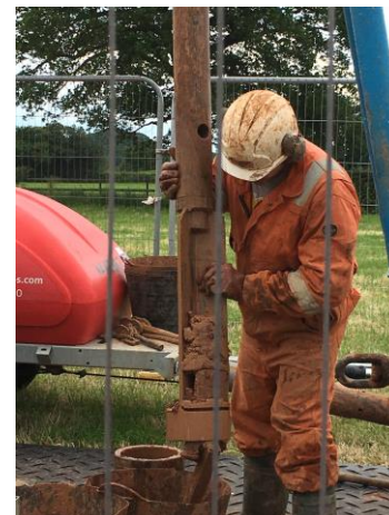
Example of Ground Investigation works