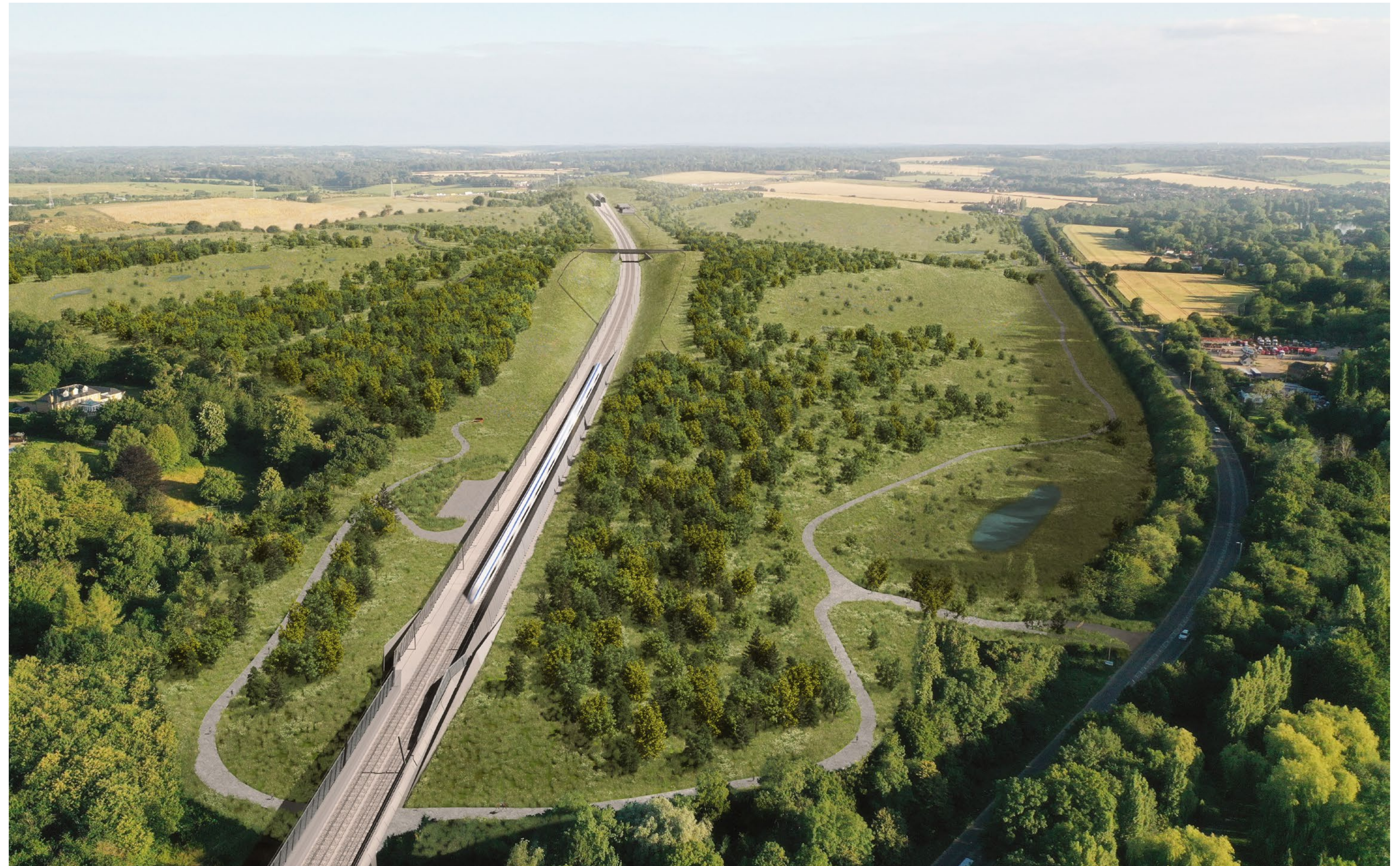
Visualisation - Elevated view over the CVWS looking north west (Year 15)