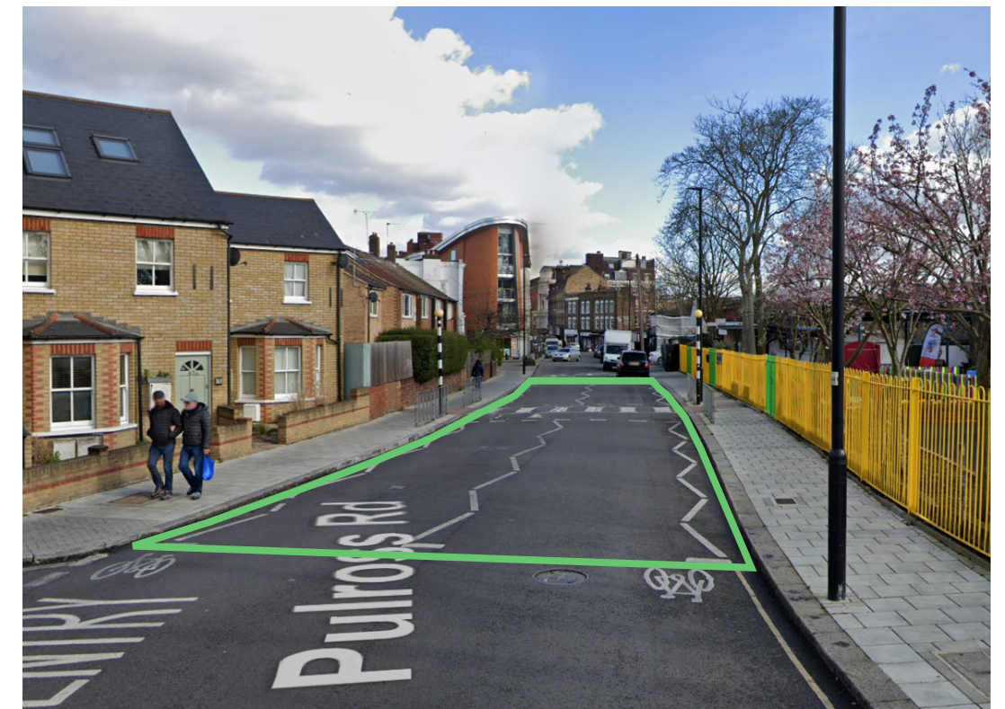
Street View - Looking East