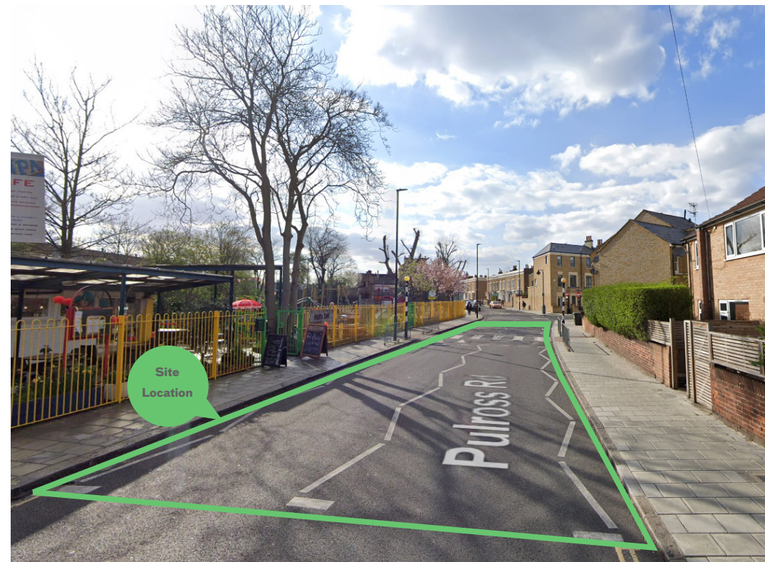
Street View - Looking West

To present your design you could use Sketch-up, Street-mix, Powerpoint, a scan or picture, a collage, a screenshot/ screen recording from games like Minecraft.