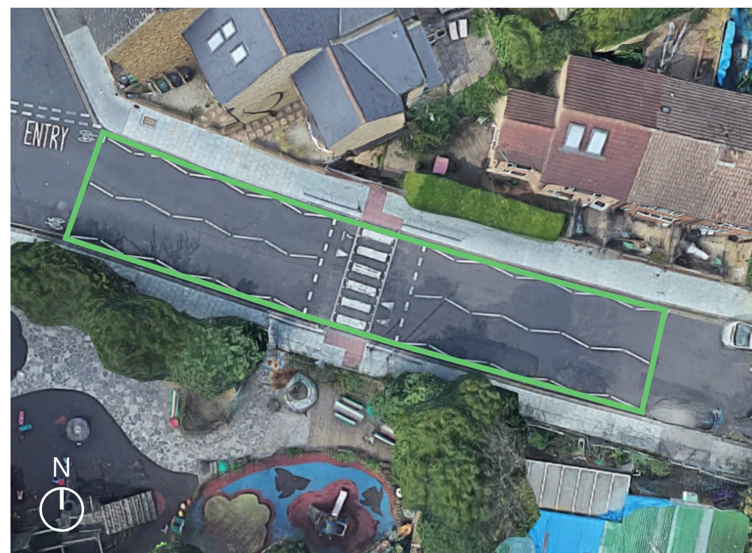
Top Aerial View