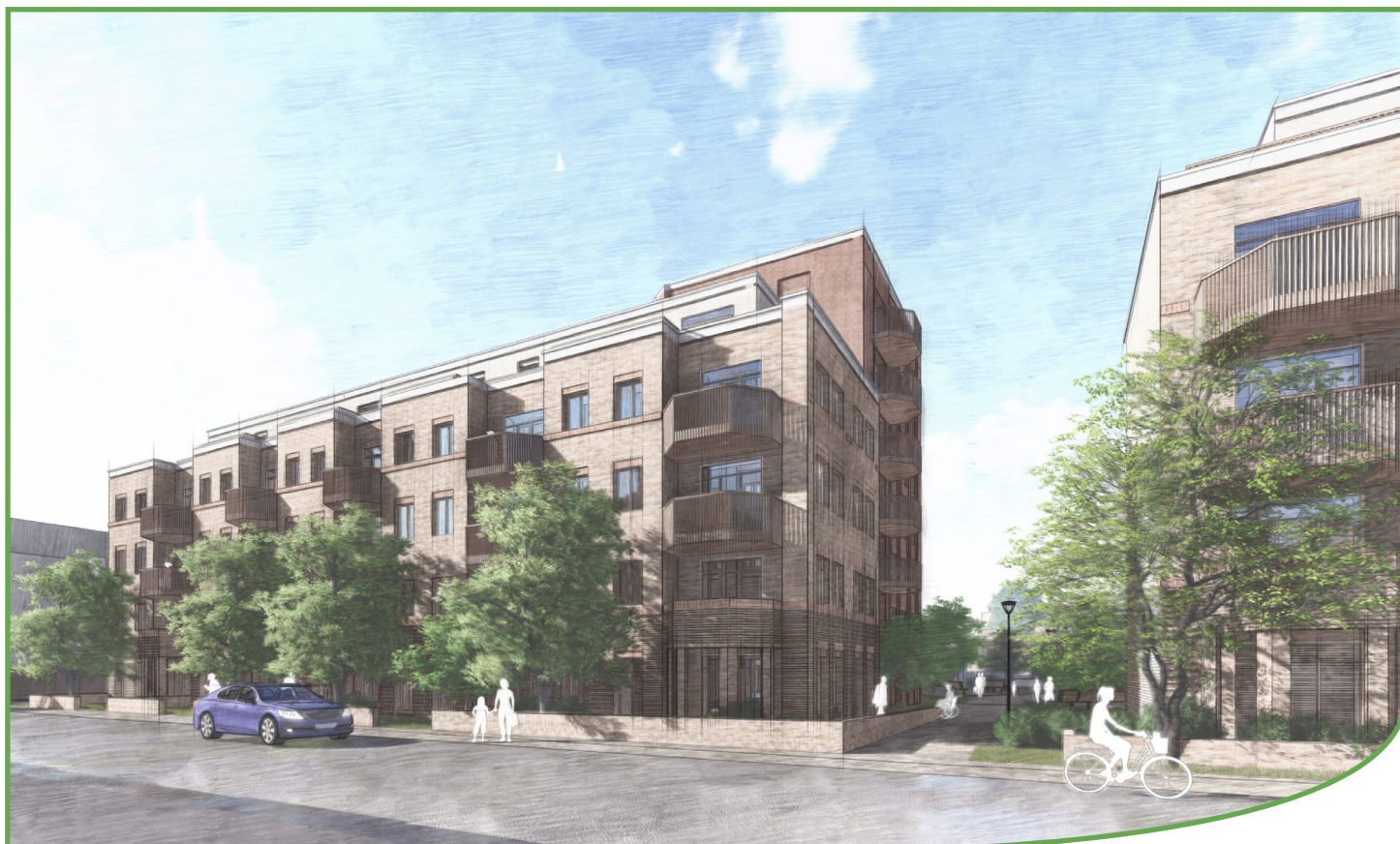
Proposed view from Pellant Road