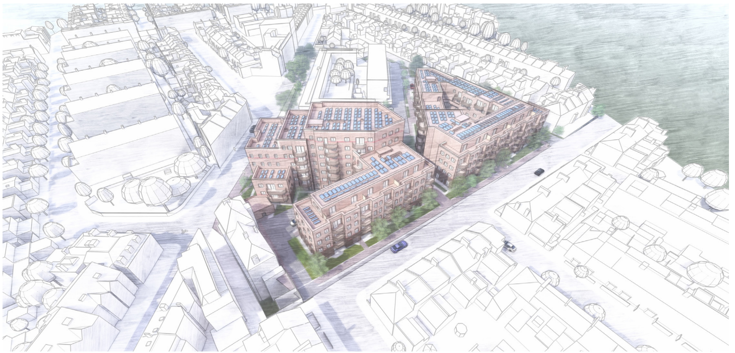
Current site aerial taken from Pellant Road