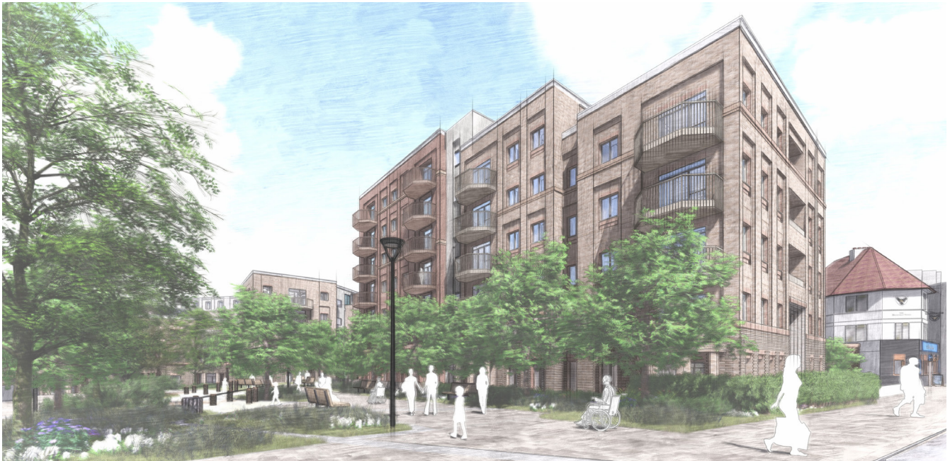
Proposed view from Dawes Road