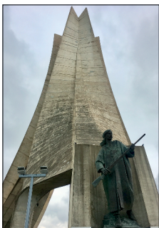
Insert © here

Global health is not merely a constellation of diseases, a collection of national health systems, or even a set of values. It is a way of looking at our world. It seeks to