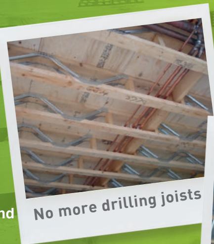
No more drilling joists