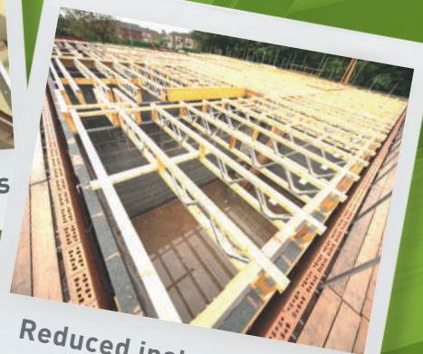
Reduced installation time