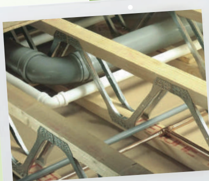
Easier to install services