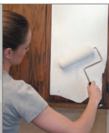
Cabinets & Doors