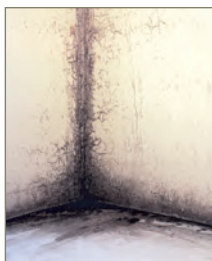
Mold & Mildew