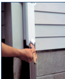
Chalky Aluminum Siding