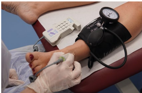
Figure 5: Assessment of arterial circulation by Doppler Pressure Indices

If there are concerns about the patient's arterial circulation, examine the patient supine on the couch, palpate foot pulses and perform an arterial Doppler examination (Fig 5). Consider referring patients with arterial disease and offer life-style advice (smoking cessation for example).