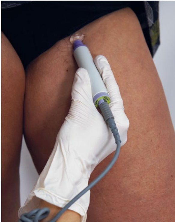
Figure 3: CWD for detecting saphenofemoral reflux