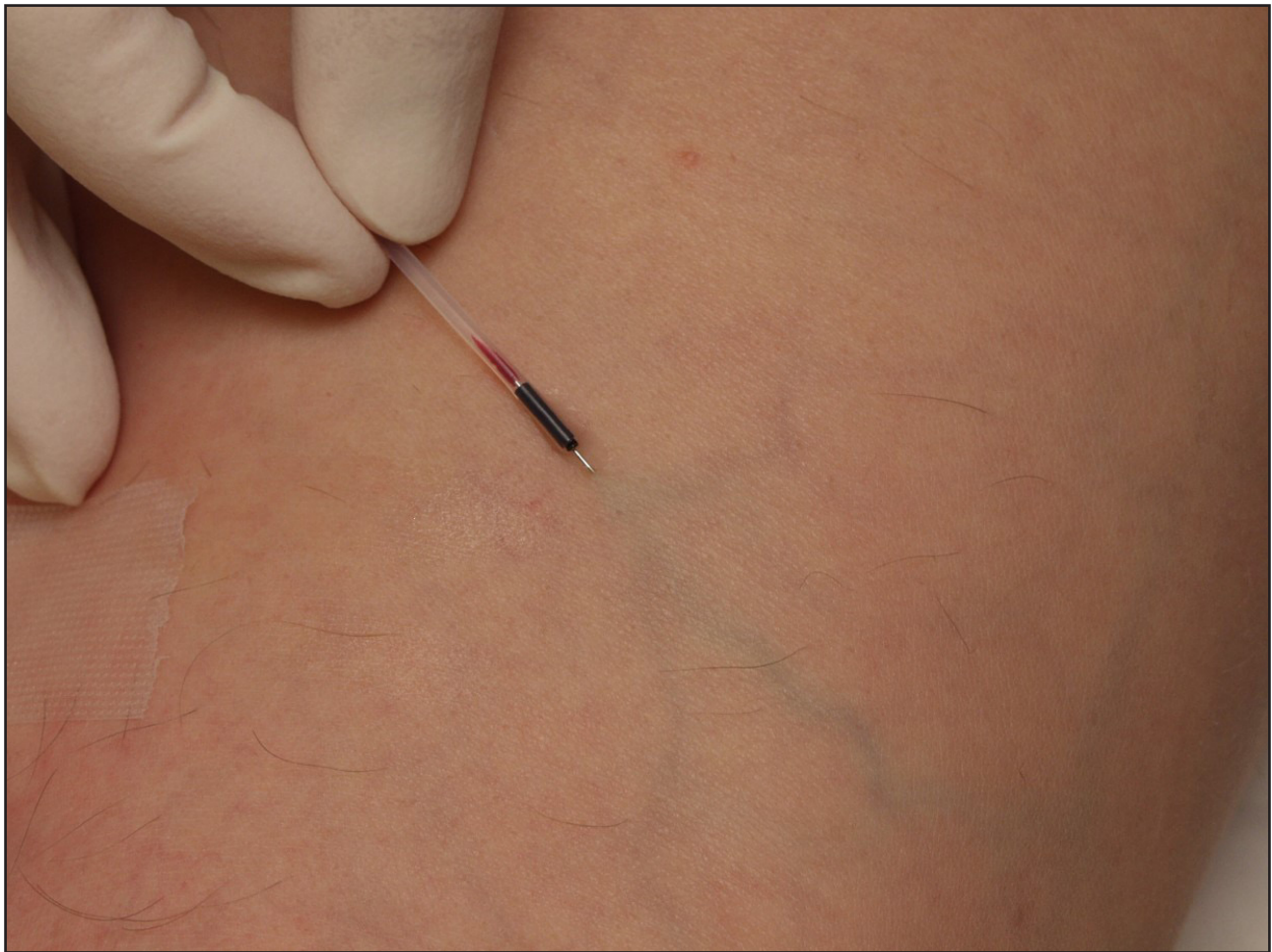
Reticular vein injection image provided courtesy of Mr Philip Coleridge Smith

as effective as other types of treatment in achieving durable obliteration of varicose veins.