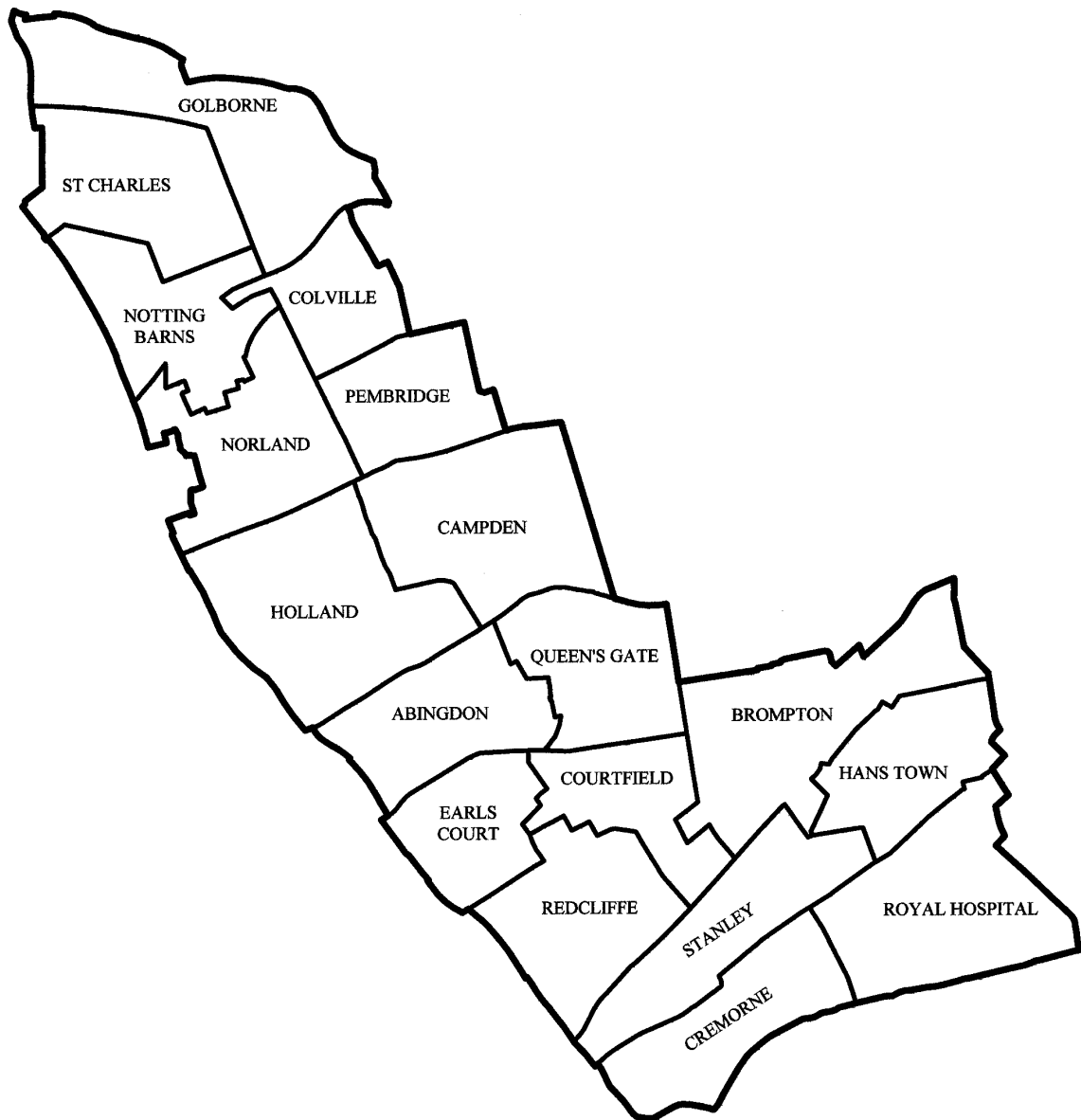
Map 2: The Commission's Final Recommendations for the Royal Borough of Kensington & Chelsea