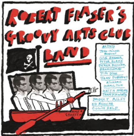
© Robert Fraser's Groovy Arts Club Band, special edition double vinyl album, artwork by Derek Boshier.