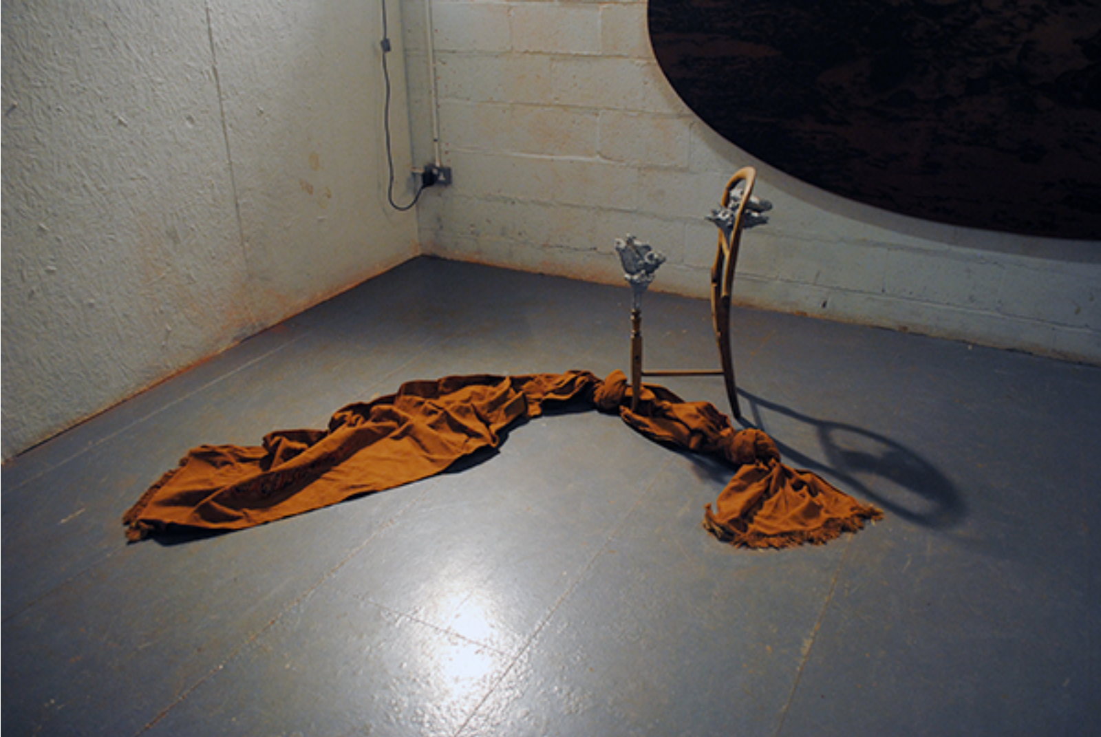
Image: Saad Quresh, For New Beginnings, photo: P A Black © Artlyst 2016.

Qureshi is working in charcoal and red brick dust to create drawings that explore other worldly environments; abstracted landscapes that form a relationship between drawing and sculpture through materiality, with imagery somewhere between the real and the imagined. The artist creates a series of mysterious red landscapes akin to the topographies of some unknown planet.