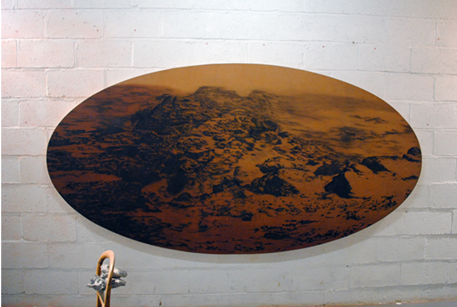
Image: Saad Qureshi, For New Beginnings, photo: P A Black © Artlyst 2016.