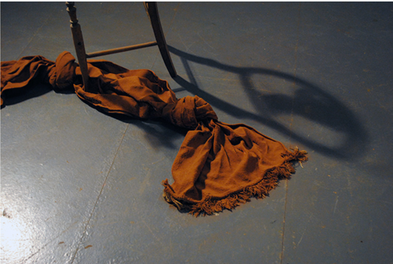
Image: Saad Qureshi, For New Beginnings, photo: P A Black © Artlyst 2016.

Qureshi is working in charcoal and red brick dust to create drawings that explore other worldly environments; abstracted landscapes that form a relationship between drawing and sculpture through materiality, with imagery somewhere between the real and the imagined. The artist creates a series of mysterious red landscapes akin to the topographies of some unknown planet.