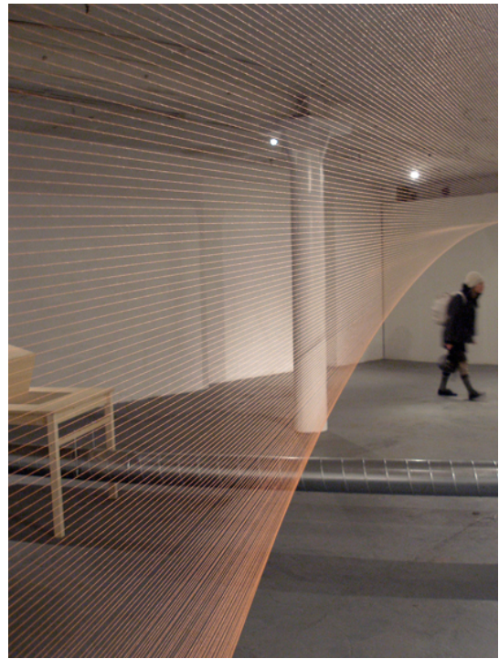
Thread Installation #23, 2010 Kate Terry 1749 x 1290 x 310 cm

Kate Terry's quietly spectacular installations employ simple materials such as thread and pins to dramatically map and transform the spaces into which they are installed. Recalling images of harmonic structures such as harps or the tightly ordered interiors of a piano, her meticulous installations reveal themselves slowly to the viewer and offer a seductive and sensational re-working of the spaces they inhabit. Kate's work has been shown to acclaim internationally and has been purchased for public collections including the National Gallery of Canada.